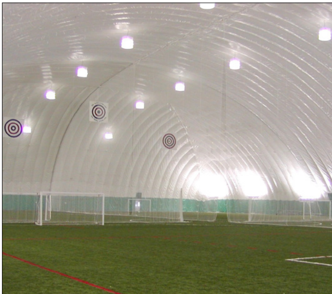
Net Cage for DIRECT Fixtures