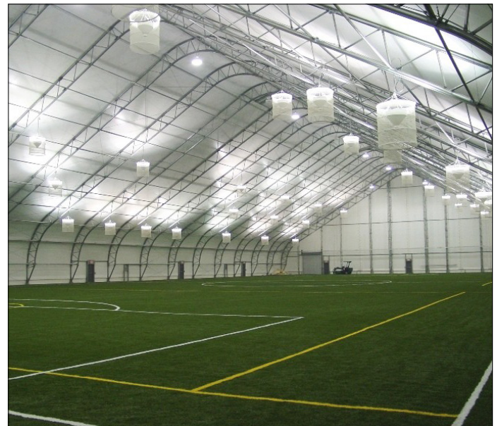
Net Cage for INDIRECT Fixtures