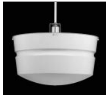
available with or without rib